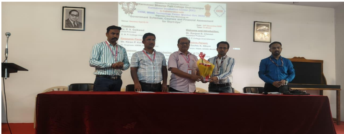
The felicitation of the speaker