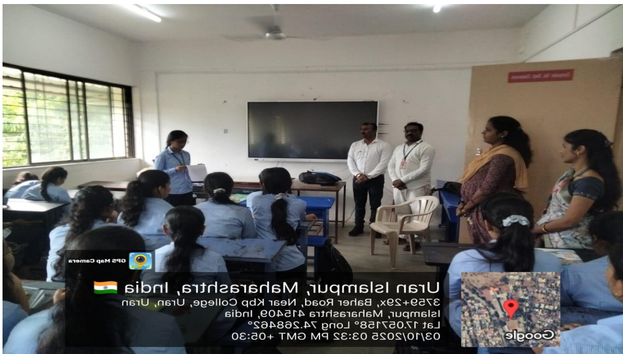
Vote of thanks