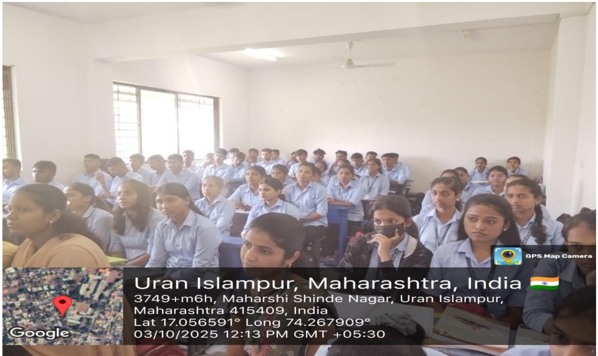
Students of the B. C. A. actively participated in the Linux Operating System session