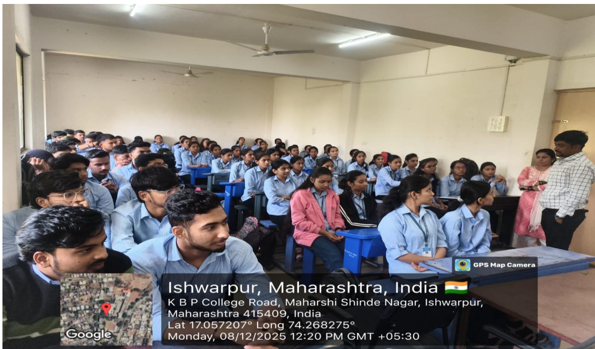
Students of the B. C. A. actively participated in the Mobile Application Development Training