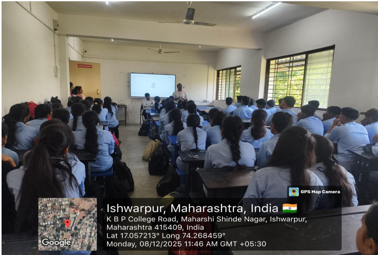
Proposed Vote of thanks by HOD P.M.More Sir