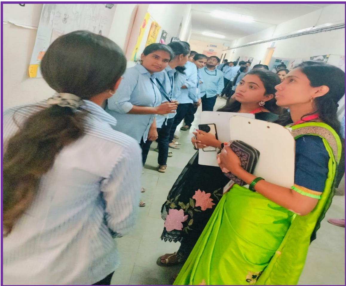
Judges examining during poster presentation