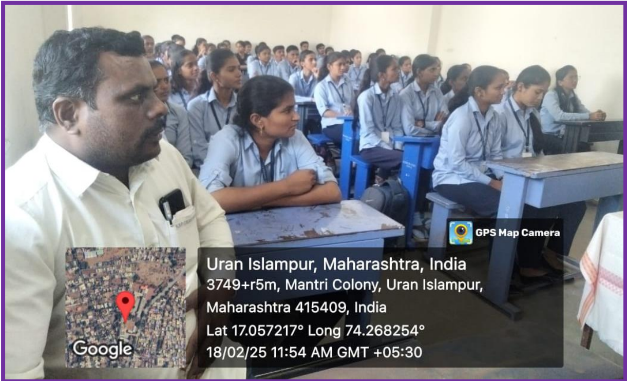
Students Present Display Day 2k25 event