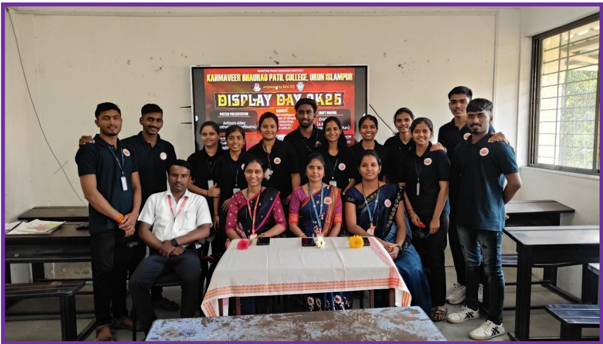
“DISPLAY DAY 2k25 Event” Committee members.