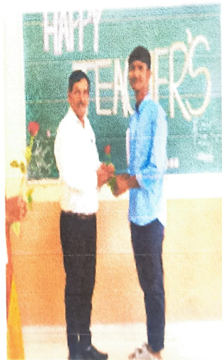
Teacher's Day Celebration - 2024-2025