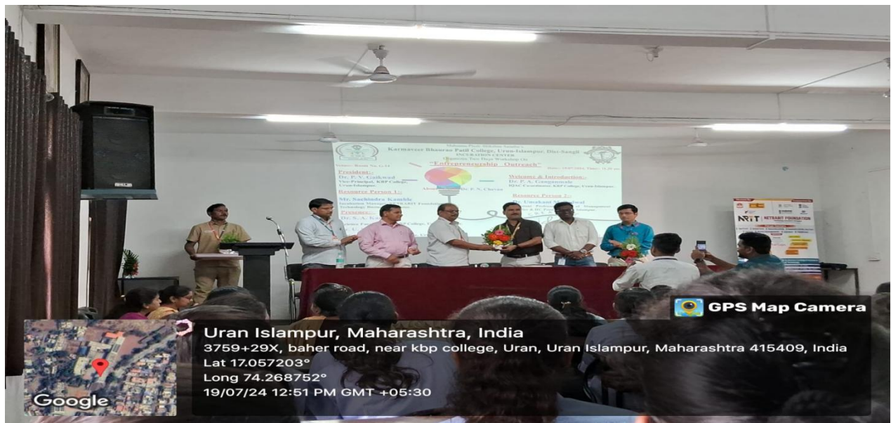
Vice Principal Sir felicitating our Resource Person