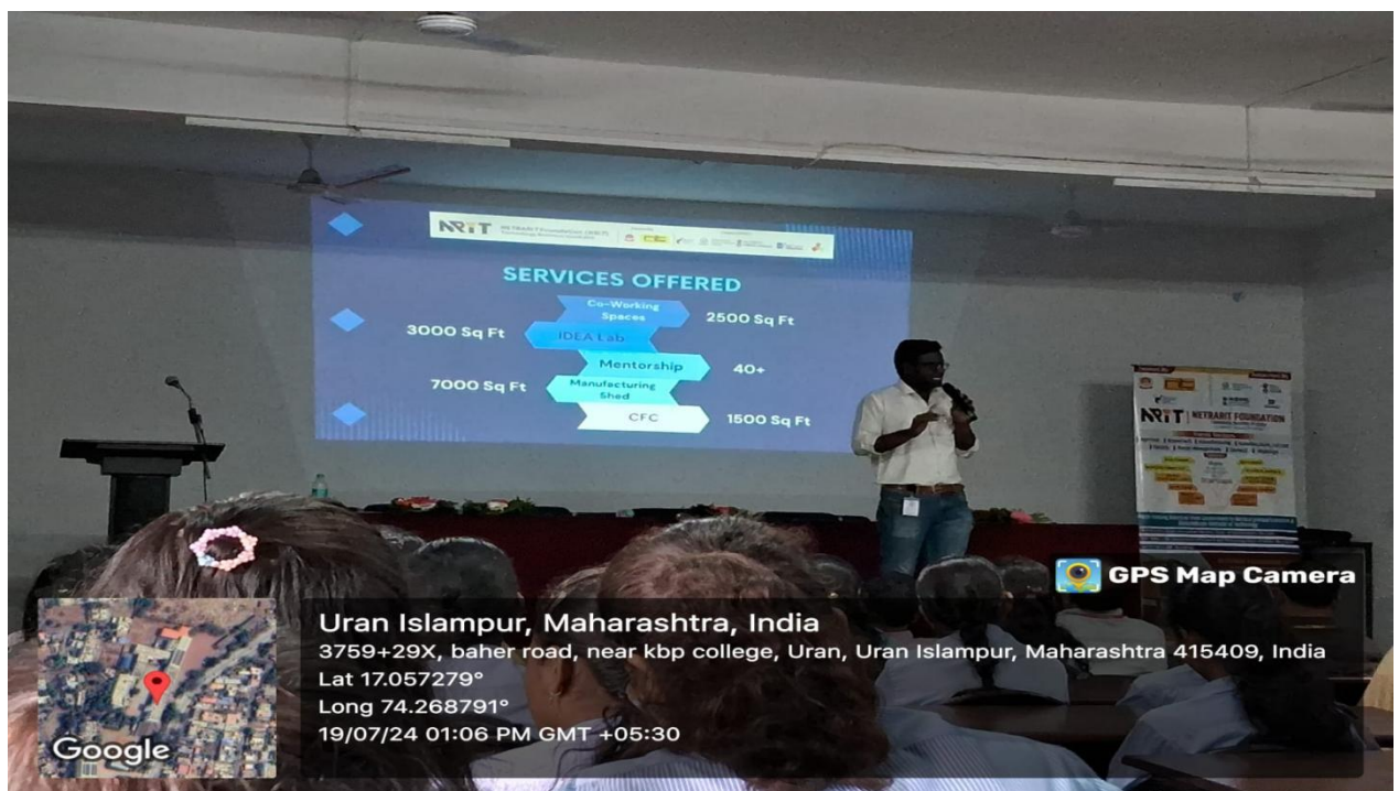
Resource Person Delivering Lecture