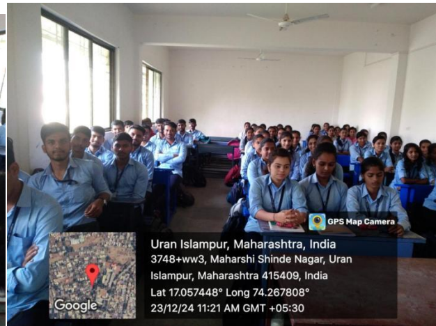
Students present over the lecture on Project Development.