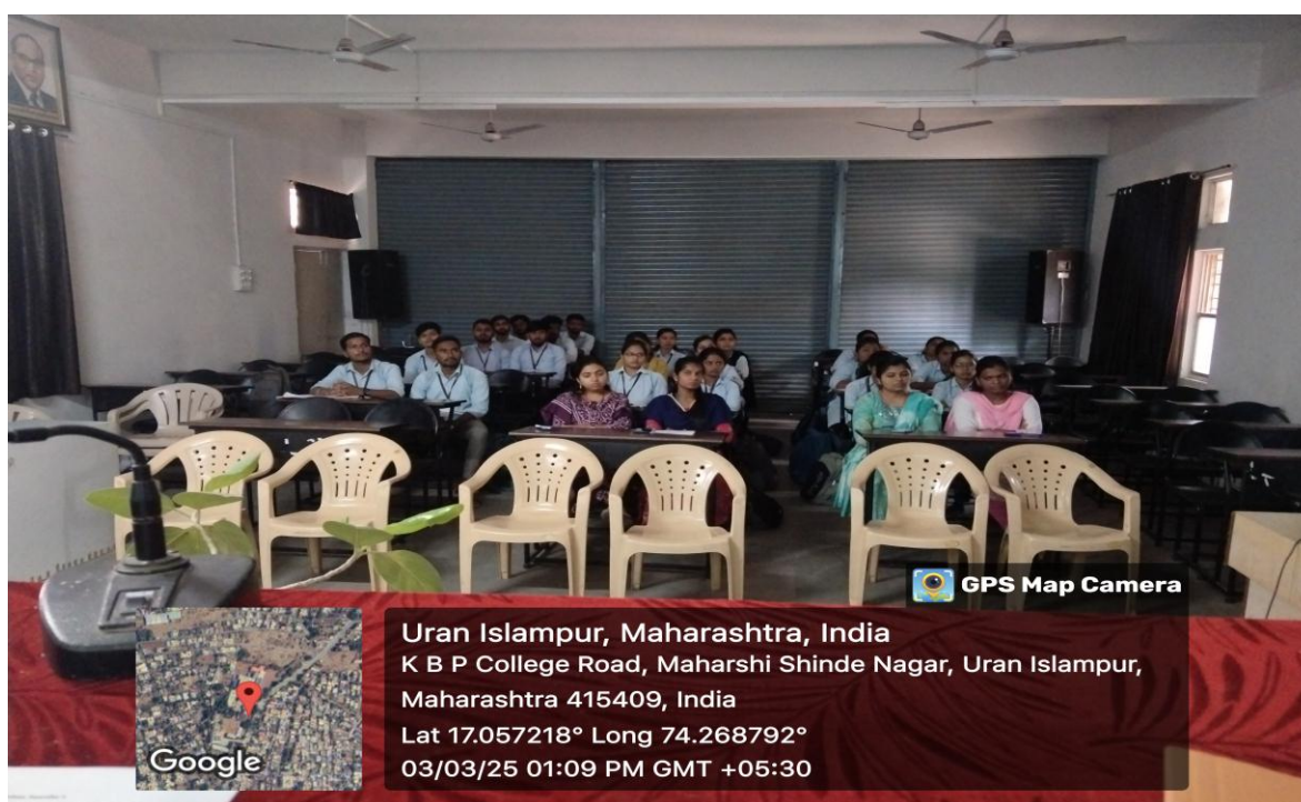
Participation of PG Students in NET SET Workshop.

[Signature] HEAD DEPARTMENT OF CHEMISTRY K. B. P. College, Uran-Islampur.