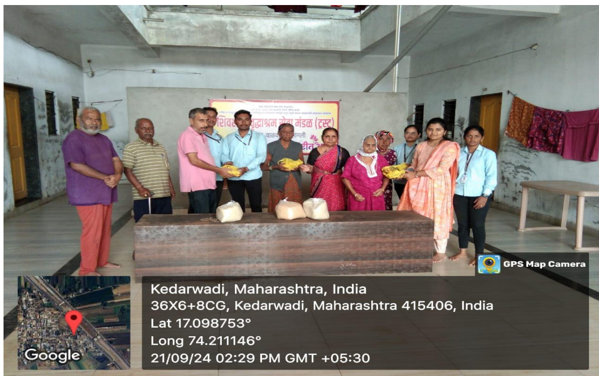
Karmaveer Jayanti 2024- Fruit and Grain Donation to Oldage Home Nerle