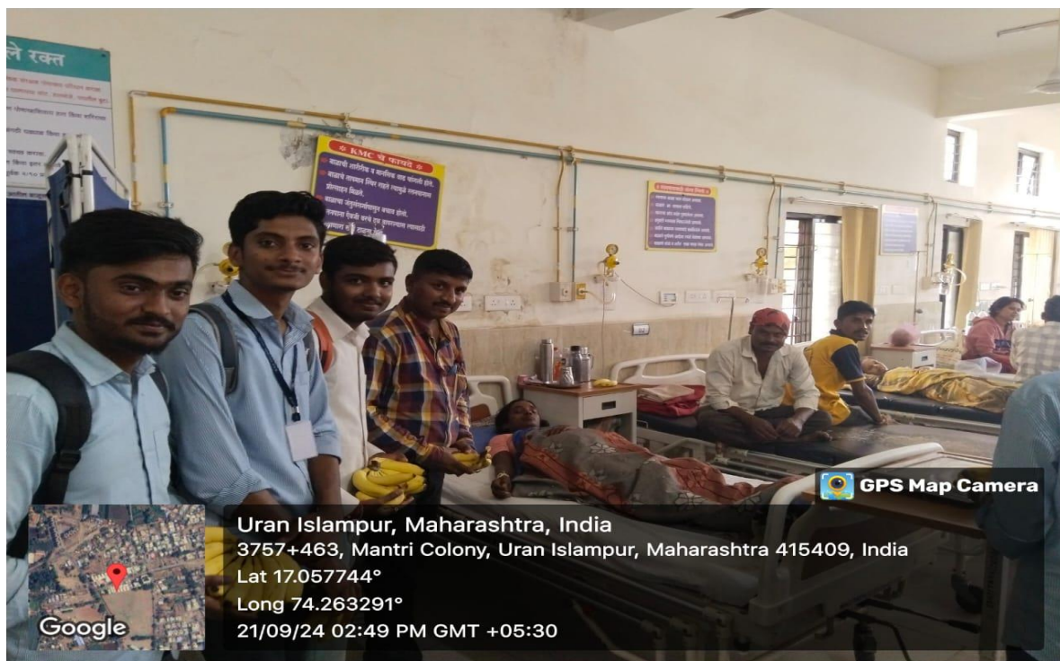
Karmaveer Jayanti 2024- Fruit Donation to Civil Hospital Islampur