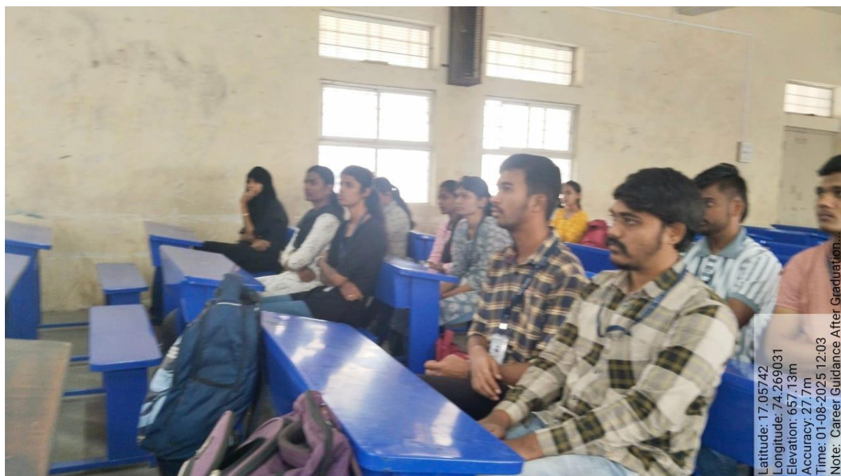
B.Sc. III students participated in Workshop of Career Guidance after Graduation.

[Signature] HEAD DEPARTMENT OF CHEMISTRY K. B. P. College, Unn-Islampur.