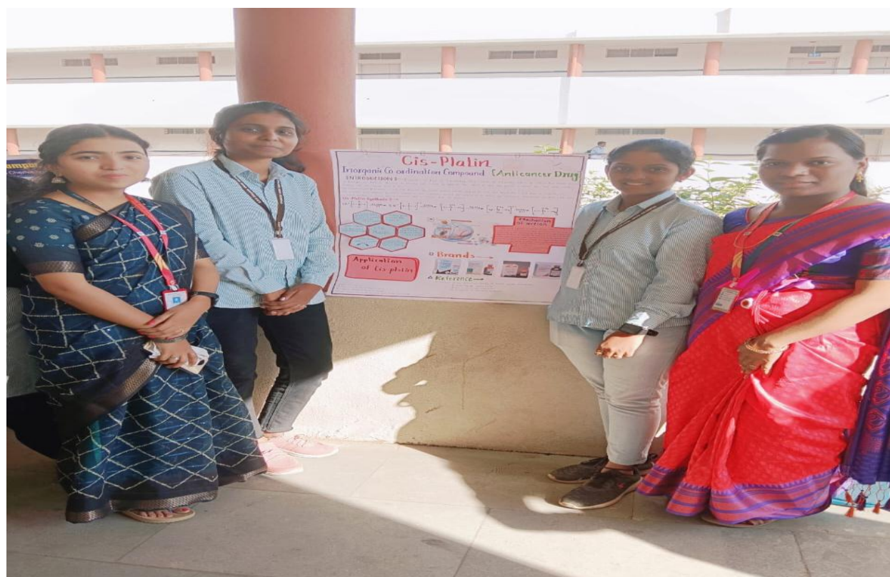
Participation of PG students in Poster Presentation