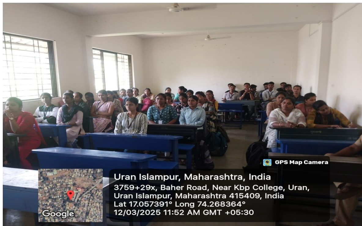
Participants at workshop on Intellectual Property Right